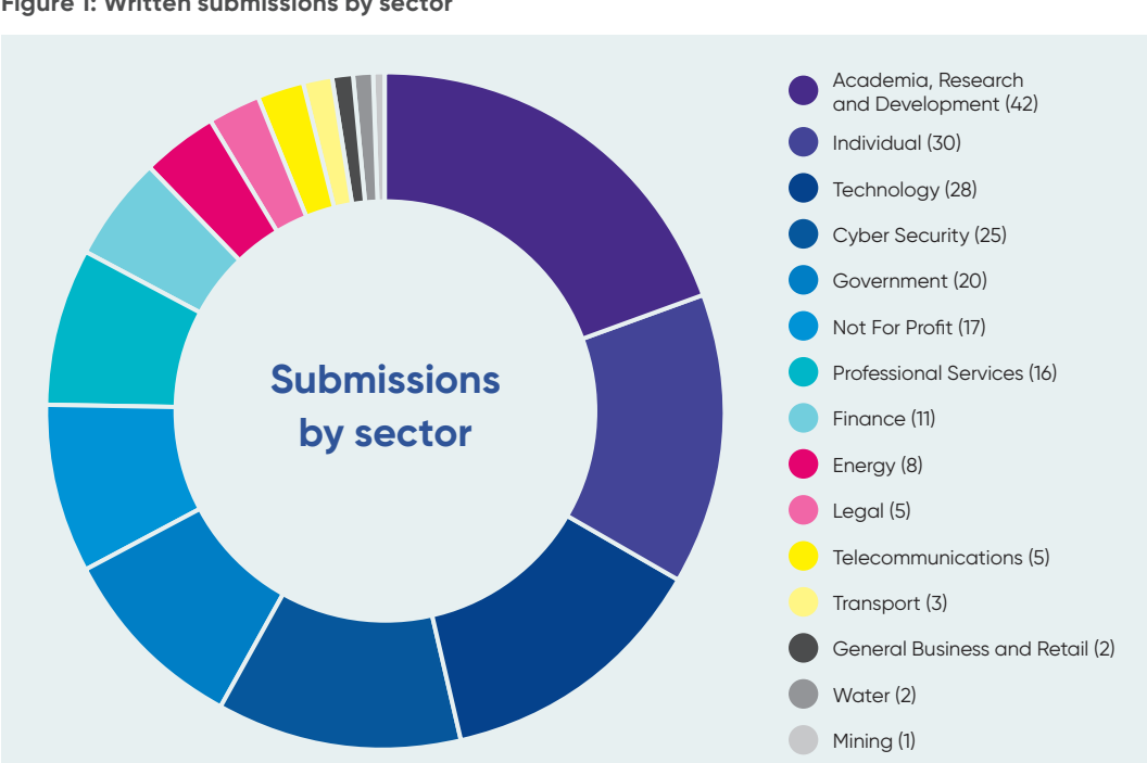
Figure 1: Written submissions by sector

A public discussion paper posted to the Department of Home Affairs website on 6 September 2019 was downloaded more than 2,500 times while submissions were open. Home Affairs received a total of 215 submissions, 156 of which were public and made available to the Panel. The remainder were confidential and were not provided to the Panel. A wide range of stakeholders made submissions, including cyber security companies; critical infrastructure providers; small, medium and large businesses; state, territory and local governments; legal experts; consumer and other advocacy groups; and academia (see Figure 1 below).